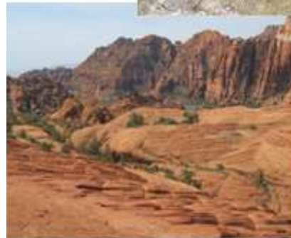
Snow Canyon and Valley of Fire State Parks