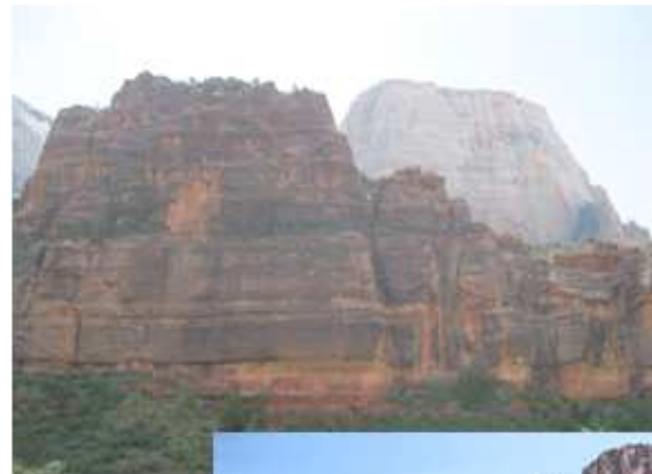
Zion and Kolob

While we touched many typical tourist bases, it feels good to think we did some things that fewer than one in a hundred people visiting in and around Zion do. I'll bet it's closer to one in a thousand.