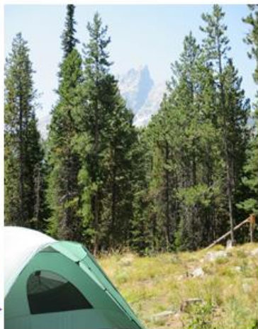
Camping at Jenny Lake with peeks at the peaks